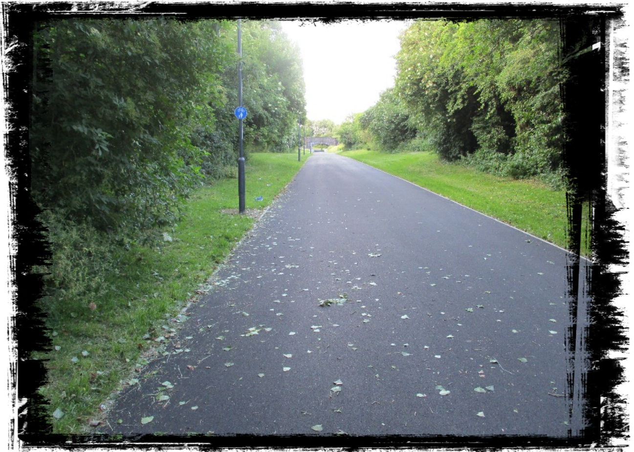
After a relatively short distance, the bridge that carries London Road comes into view. To the right of the bridge is Wickes DIY store.